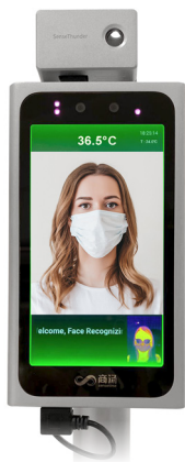
成功 體溫正常 Success-Normal Temperature