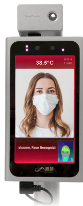
體溫異常 Abnormal Temperature